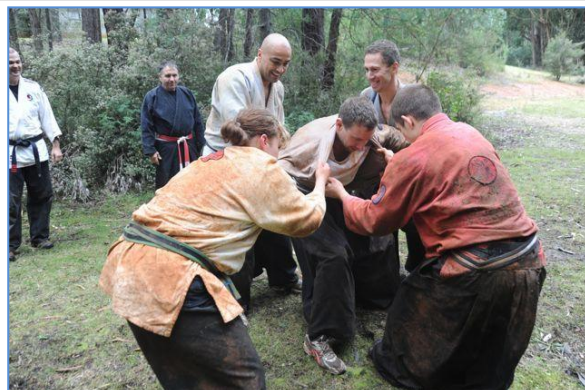
Winter camp 2010 – Pulling in opposite directions, four struggle to topple one.

"Next year can be big step forward for everybody but all members must act in concourse..."